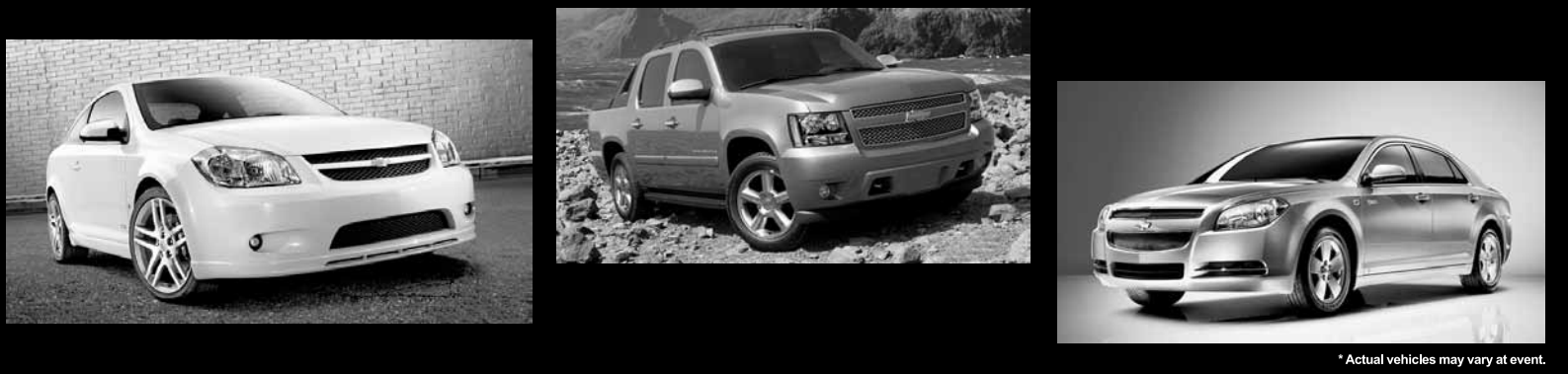
* Actual vehicles may vary at event.

An overall Junior Achievement Golf Classic Champion will be crowned. Each of the three session 1st place teams will vie for a trophy team prize. It will be given to the team with the best net team handicap score. If necessary, a scorecard playoff will occur.